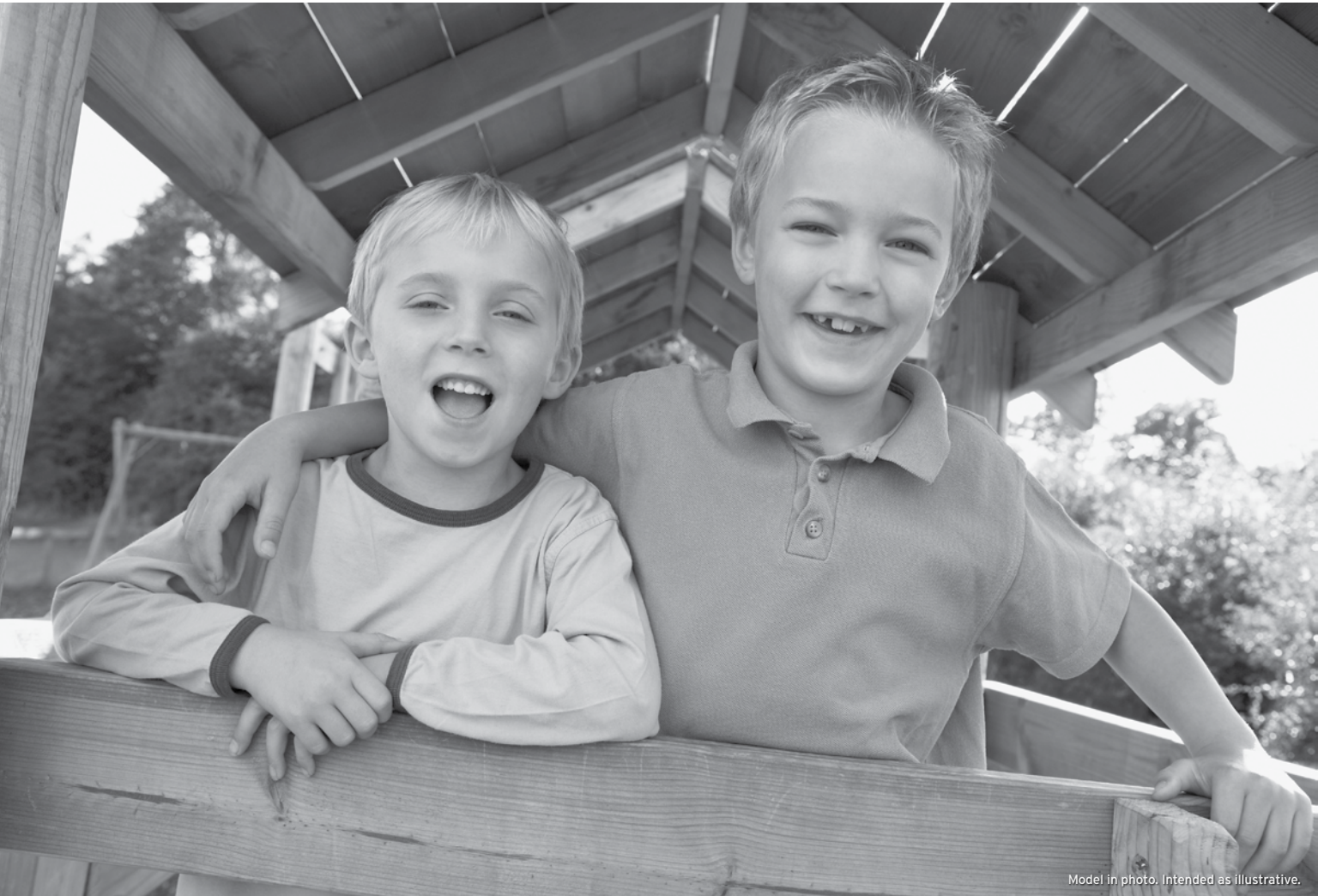
Model in photo. Intended as illustrative.