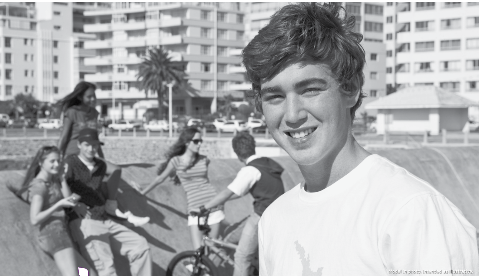
Model in photo. Intended as illustrative.